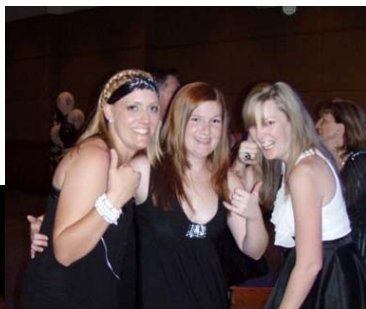
The gorgeous Northern Branch girls