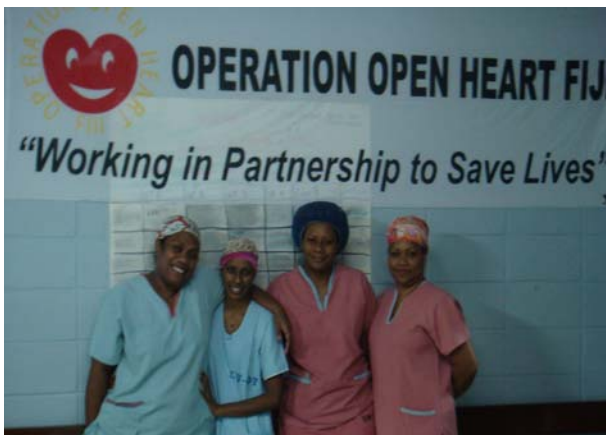
Local Fijian Nurses

day at a local resort. Many of the team members were regulars on the annual Fijian trip. Others, including myself were new team members and we enjoyed this day as an opportunity to get acquainted with the rest of the team.